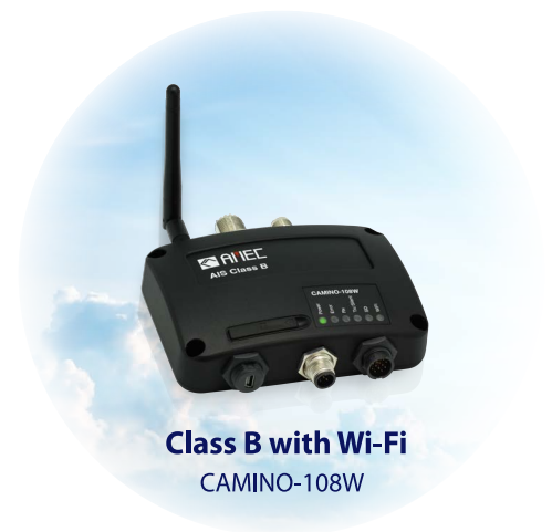
Class B with Wi-Fi CAMINO-108W